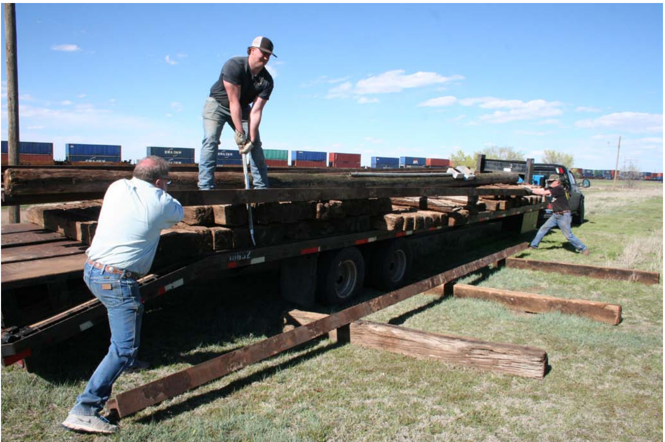
Top: Street side of the train station. Center: Track side of the train station. Bottom: The Castenada undergoing restoration and renovation.