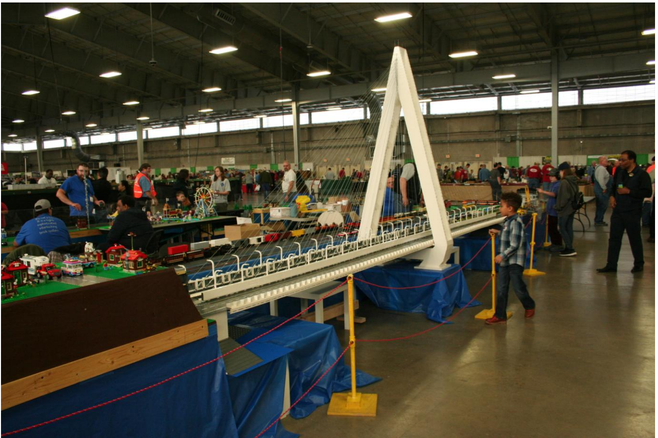
LEGO layout with LEGO cable-stayed bridge.