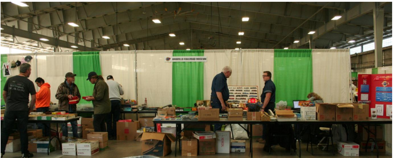
ARM Booth before show opened Saturday morning; other vendors shopping while we were setting-up.