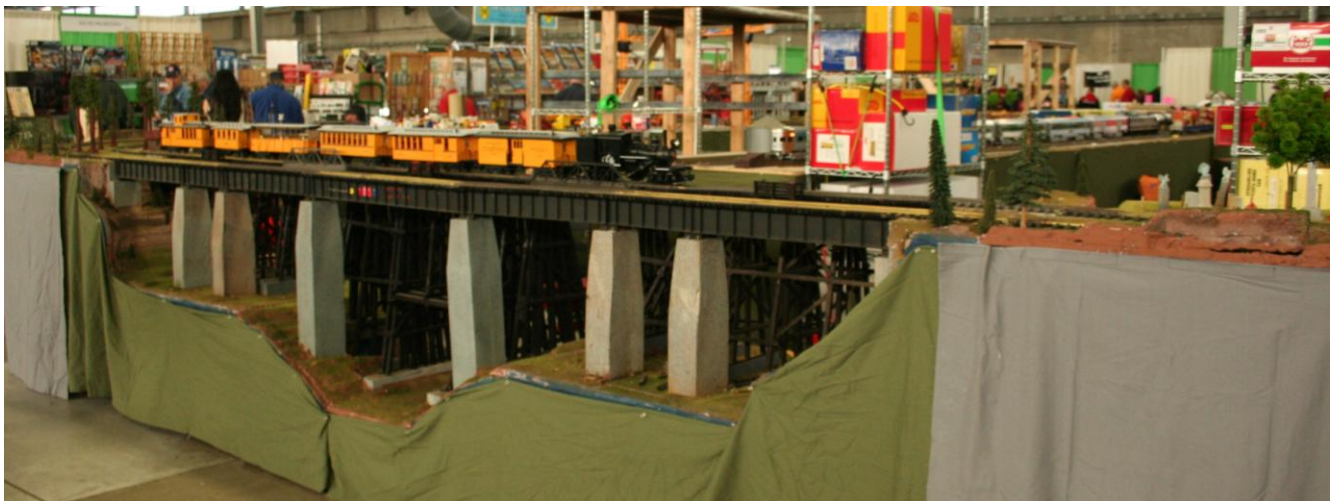
Another view of the G-scale Rio Grande modular layout.