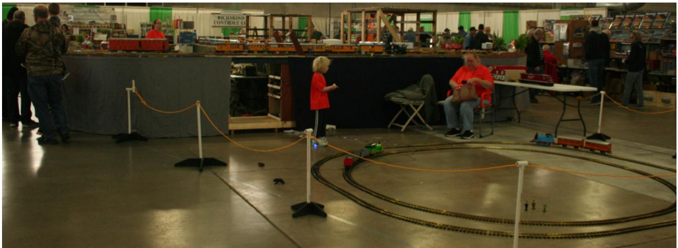
G-scale: Thomas the Tank Engine & friends on the floor with the Rio Grande on modular layout in background.