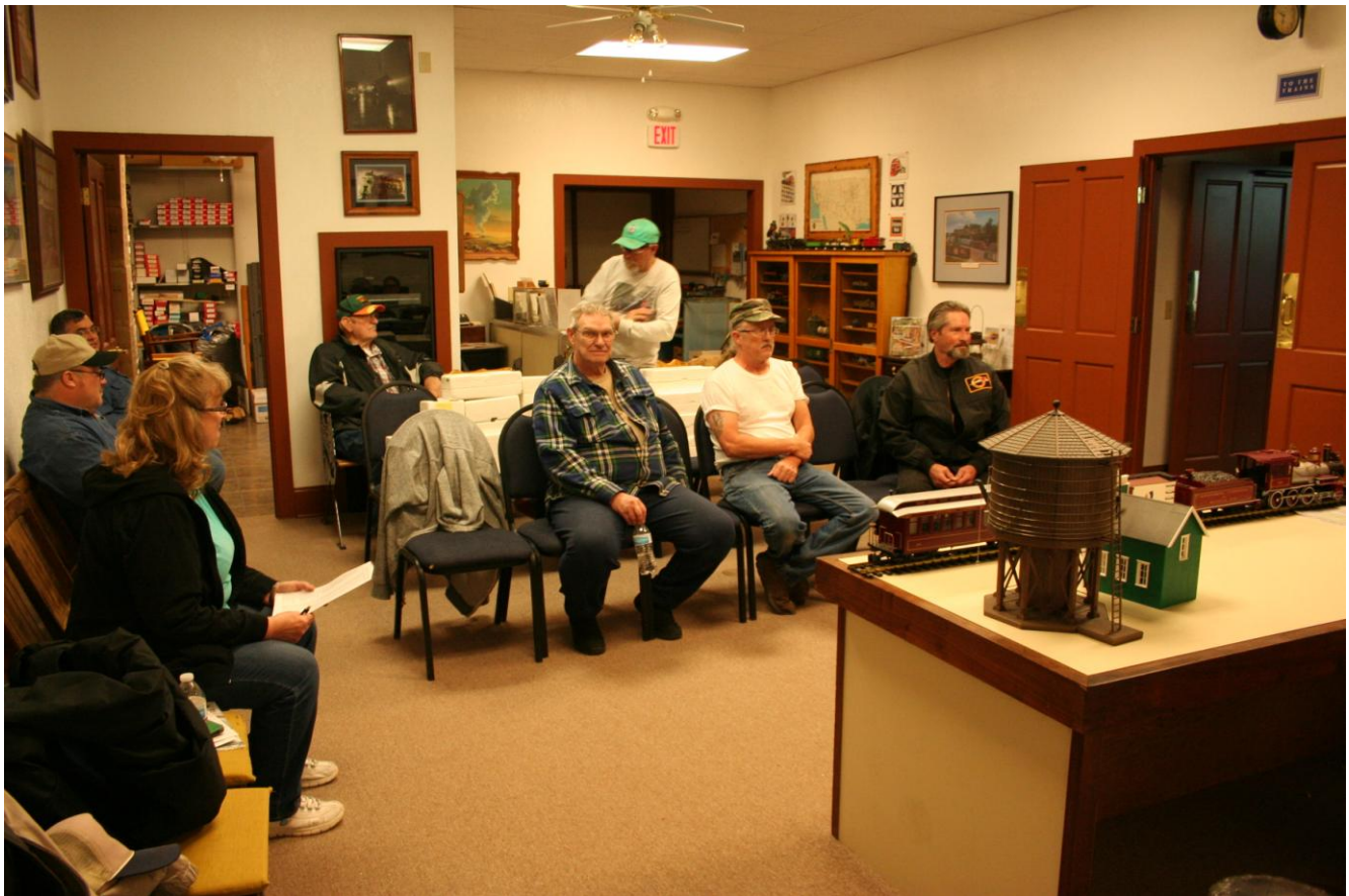
Nov. 14, 2019: Members present for a brief pow-wow.