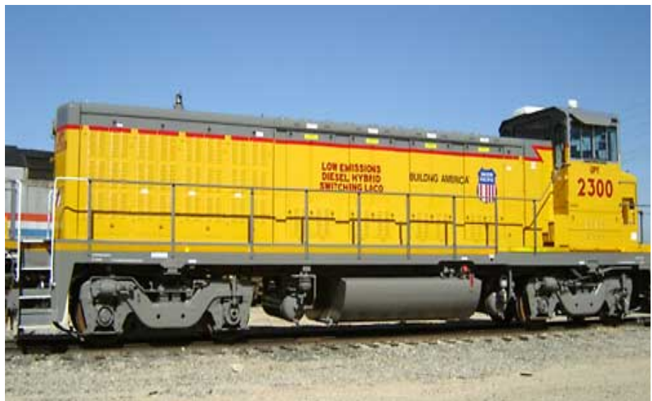
See News note on page 6