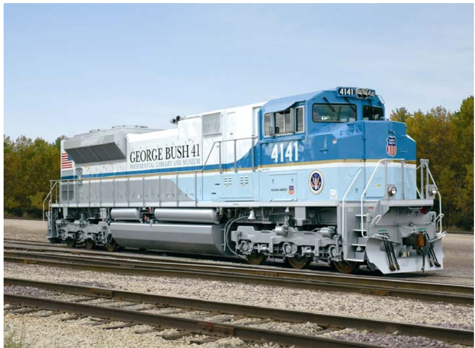
Picture of the UP engine #4141 to commemorate the opening of the President Bush Library