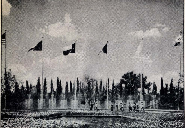
THE PROUD AND THE BEAUTIFUL —Shown above are flags of Spain, France, Mexico, Republic of Texas, the Confederacy and the United States of America waving proudly over the beautiful SIX FLAGS Over Texas family entertainment center. The nostalgic history of Texas under six flags is recreated inside the $10,500,000 amusement park. The perfect setting for the six flags is created by a semi-circle of Dancing Waters in front of the flags. The six flags are immediately inside the entrance to the Park and are directly behind the beautiful Star Mall.

TEXAS ZEPHYR DAILY BETWEEN DALLAS FORT WORTH WICHITA FALLS AMARILLO COLORADO SPRINGS AND DENVER • NO EXTRA FARE •