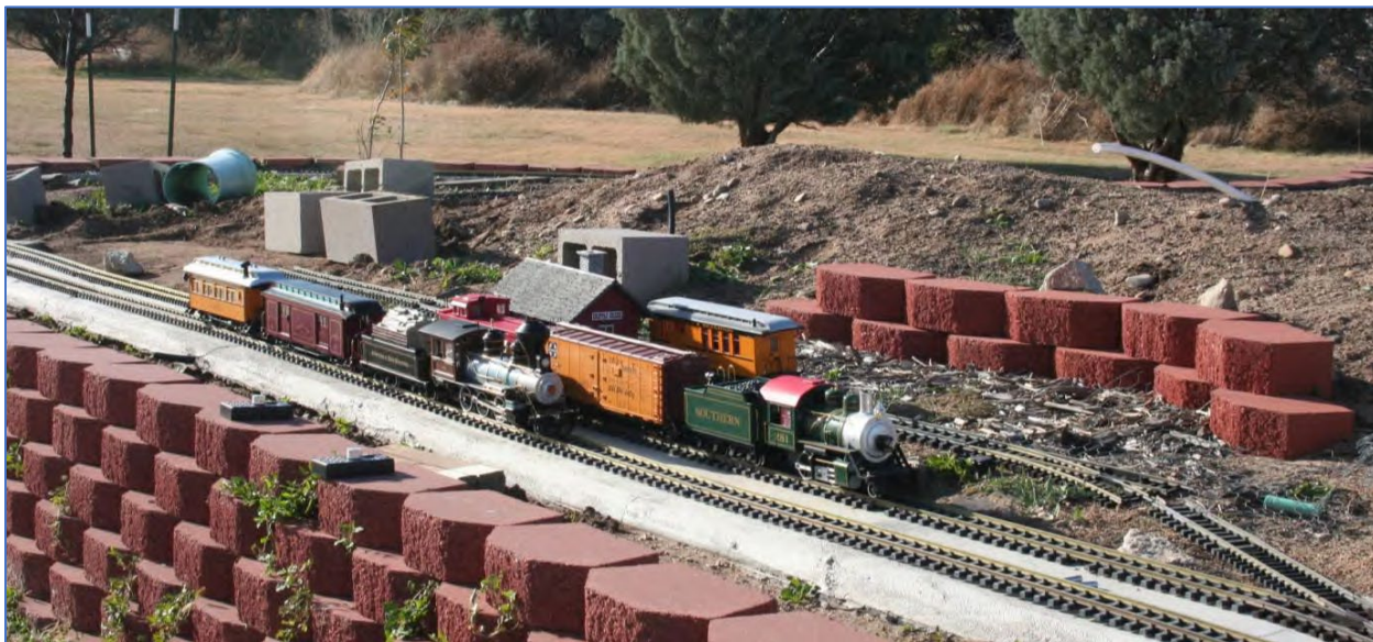
Bob Roth Photo