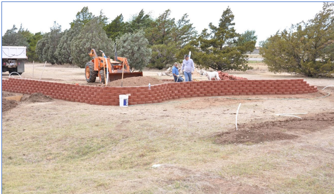
Below. Supervisor Brandie makes sure Tracy and Earl are doing things correctly. The interlocking bricks made a pleasing layout wall. the white tubing in the foreground is for drip irrigation of trees.