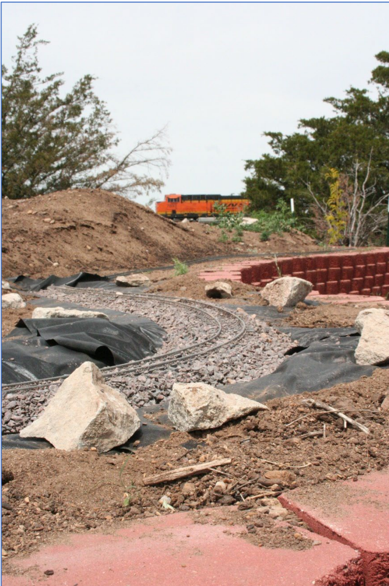
What could be better? Constructing an eye-catching G-gauge layout outside on the museum grounds as a BNSF freight hums westbound toward Junior Yard in Amarillo. The "Transcon" can see 70-80 trains per day.