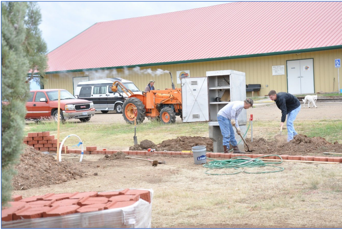
Above. As the electrical box is leveled and “planted,” another load of soil heads toward the layout.